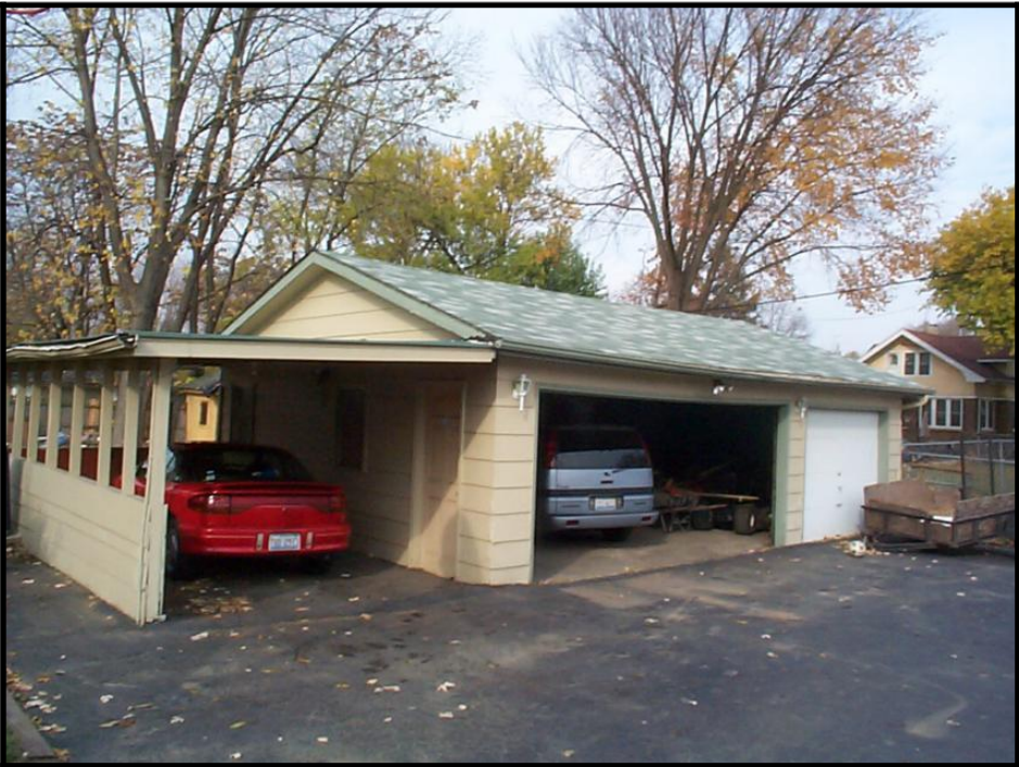
SUBJECT'S DETACHED GARAGE